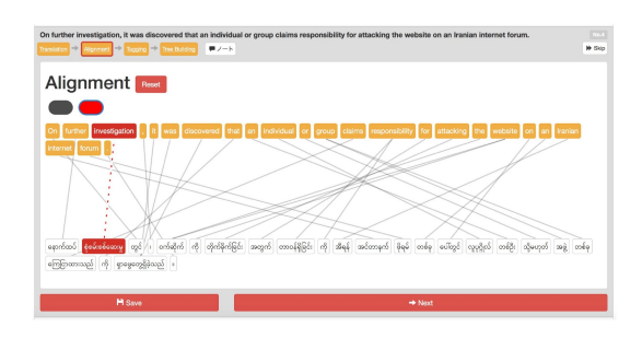
Fig. 1. Word alignment interface

This server also supports users, groups and task management and has a multilingual help system. The administrator can assign particular tasks to users considering their linguistic expertise (such as assigning only translation tasks etc.). If the user is assigned all tasks he/she can continuously and efficiently work through all processes for the given sentence. For word alignment, POS tagging and syntax annotation, user input can be performed using only the mouse. Fig. 1 shows the user interface for word alignment annotation between an English sentence and the corresponding translated Myanmar sentence, and Fig. 2 shows the user interface for syntax annotation, or constituency tree building [12].