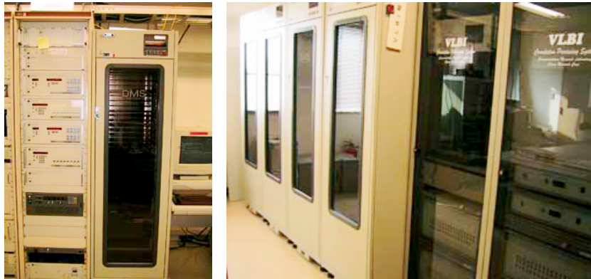
Figure 1. K-4 VLBI observation system at observing stations (left) and K-4 correlator system at Kashima Space Research Center (right).

The main concept of the developments of the K-4 VLBI observation and data analysis system was to minimize required human operations and to maximize operational reliability and durability. The second generation set of the K-4 VLBI system was completed through the developments of the Key Stone Project (KSP) VLBI system which started in 1994. The KSP VLBI network can be considered as an integration of the researches and developments at CRL. For the KSP VLBI Network system, a lot of technological challenges were made and realized. Figure 1 shows pictures of the K-4 observation system at observing stations and K-4 correlator system at Kashima Space Research Center.