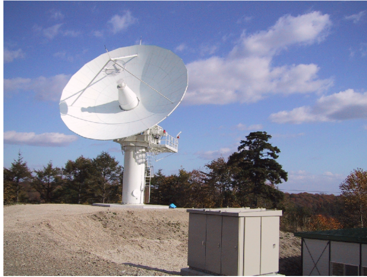
Figure 2. 11-m VLBI antenna at Tomakomai Experimental Forest of the Hokkaido University. The antenna and the VLBI observation facilities were transported from Miura KSP VLBI station in early 2001.

The last VLBI session with the Miura station was carried out on January 4, 2001. The 11-m antenna and the observation facilities of the Miura station were transported to the Tomakomai Experimental Forest of the Hokkaido University since then. The antenna was reconstructed at the new site (Figure 1) and the first successful VLBI observations were performed in November 2001. On the other hand, the 11-m antenna and the observation facilities of the Tateyama station were transported to the campus of Gifu University after the final regular KSP VLBI session on November 30, 2001. The antenna components are now waiting to be reconstructed and the new station is expected to become operational by April 2002.