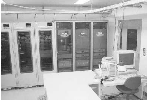
Figure 2. KSP Correlator room. The KSP hardware-correlation system, which has capability of 4 stations and 6 baselines of tape-based VLBI data processing.

KSP Correlation system[5, 6] has been operational (Figure 2). Although data processing with hardware correlator was not performed in this year. Geodetic VLBI experiments of Antarctica, which are organized by National Institute of Polar Research (NIPR), are recorded with K4 and S2 system so far. Now K5 VLBI system is installed and used for VLBI observation in Syowa station in Antarctica, although, some VLBI data recorded in S2 and K4 system are not completely processed yet. Thus the use of our KSP correlation system for the data processing of those VLBI experiments is being consulted now.