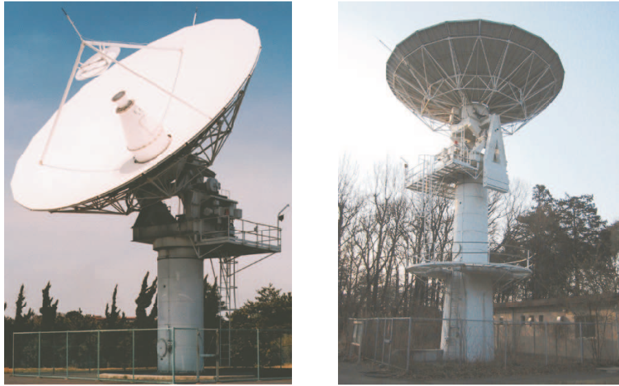
Figure 2. 11-m VLBI antennas at Kashima (left) and Koganei (right).

11-m antenna and other VLBI facilities at Miura and Tateyama stations have been transported to Tomakomai Experimental Forest of the Hokkaido University and to the campus of Gifu University, respectively. As a consequence, two 11-m stations at Kashima and Koganei (Figure 2) are remaining as IVS Network Stations. After the regular VLBI sessions with the Key Stone Project VLBI Network terminated in 2001, 11-m VLBI stations at Kashima and Koganei are mainly used for the purposes of technical developments and miscellaneous observations.