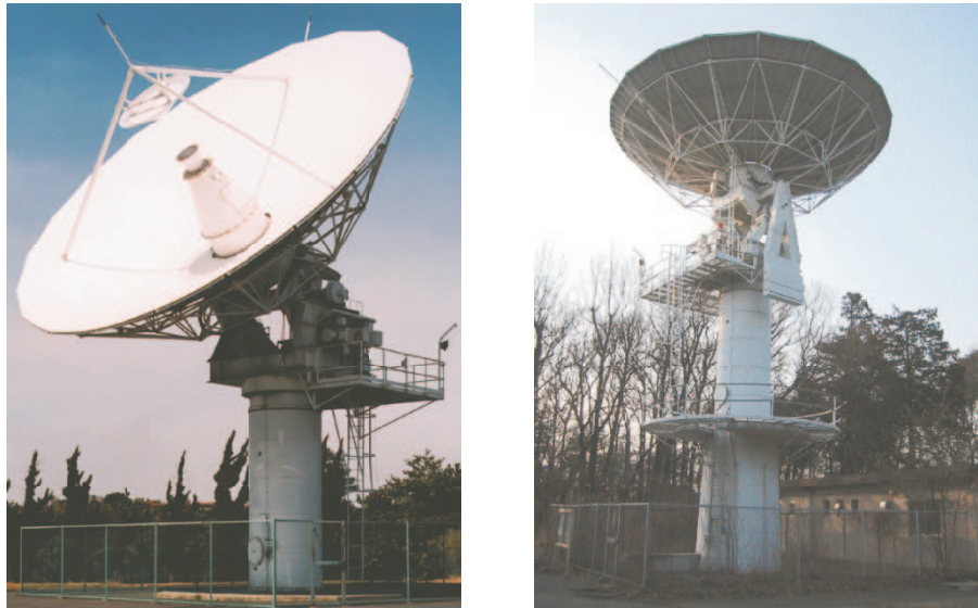
Figure 2. 11-m VLBI antennas at Kashima (left) and Koganei (right).

11-m antenna and other VLBI facilities at Miura and Tateyama stations have been transported to Tomakomai Experimental Forest of the Hokkaido University and to the campus of Gifu University, respectively. As a consequence, two 11-m stations at Kashima and Koganei (Figure 2) are remaining as IVS Network Stations. After the regular VLBI sessions with the Key Stone Project VLBI Network terminated in 2001, 11-m VLBI stations at Kashima and Koganei are mainly used for the purposes of technical developments and miscellaneous observations.