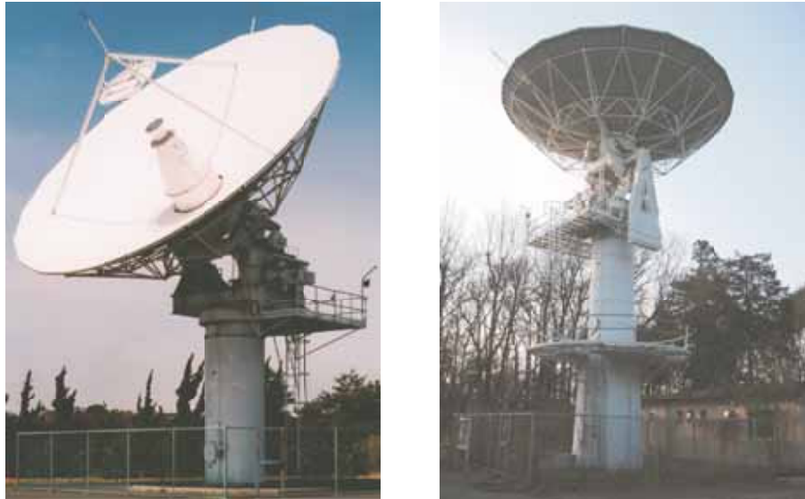
Figure 2. 11-m VLBI antennas at Kashima (left) and Koganei (right).

11-m antennas and other VLBI facilities at Miura and Tateyama stations have been transported to Tomakomai Experimental Forest of the Hokkaido University and to the campus of Gifu University, respectively. As a consequence, two 11-m stations at Kashima and Koganei (Figure 2) are remaining as IVS Network Stations. After the regular VLBI sessions with the Key Stone Project VLBI Network terminated in 2001, 11-m VLBI stations at Kashima and Koganei are mainly used for the purposes of technical developments and miscellaneous observations.