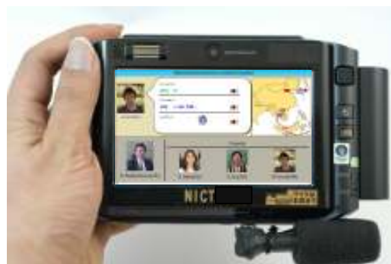
Fig. 2. The client application on a hand-held terminal device.

The client applications are implemented on a handheld mobile terminal device (Sony VAIO-U) shown in Fig. 4, which allows portable speech-to-speech translation. The device is 150-mm wide, 95-mm high, and 32-mm thick.