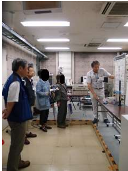
Explanation of research contents by staff.