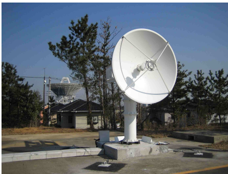
Figure 1. CARAVAN2400

with the Gifu University. In this experiment, one strong source (e.g. 3C273B) was continuously observed for 1-2 hour split up in 5 minute scans. Though a characteristic TID signal could not be detected during the experiments, the acceptable gap length between each scan was assessed in order to obtain phase change during the experiment. In addition, phase change due to the atmospheric disturbance was also investigated.