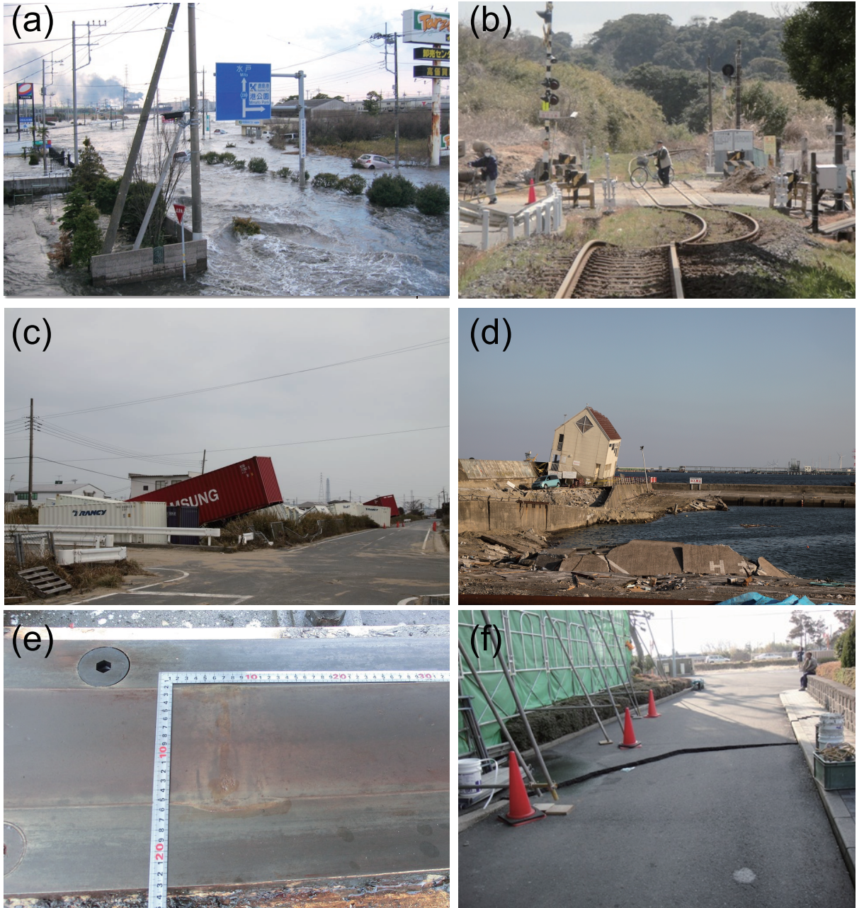
Figure 2. Earthquake damage in Kashima city. (a) Tsunami struck the Kashima port and surrounding area.[2], (b) train rail bent by powerful ground motion, (c) cargo containers thrown around by the tsunami in Kashima, (d) Kashima port hit by Tsunami, (e) ripple mark of 34-m antenna azimuth rail caused by strong motion, (f) broken road in front of the KSRC/NICT main building).