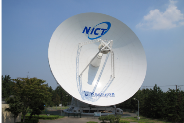
The Kashima 34-m radio telescope with new logo design of NICT.

The Kashima 34-m radio telescope (Figure 1, left) was constructed as a main station of the “Western Pacific VLBI Network Project” in 1988. After that project’s termination, the telescope has been used not only for geodetic experiments but also for astronomy and other purposes. [1]. The station is located about 100 km east of Tokyo, Japan and is co-located with the 11-m radio telescope and the International GNSS Service station (KSMV) (Figure 1, right). The station is maintained within the Space-Time Measurement Project of the Space-Time Standards Group, NICT.